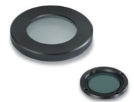
Simple polarising attachment