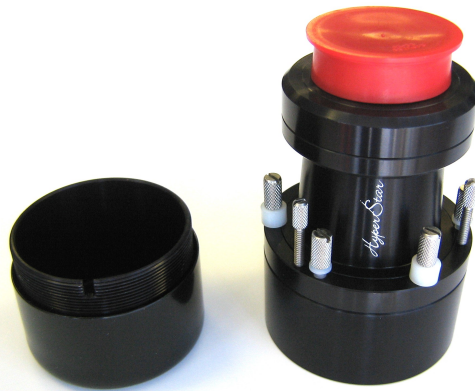
Holder removed to accept secondary mirror