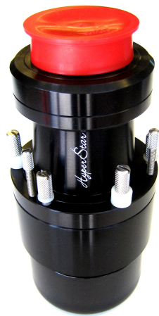
Holder capping the HyperStar