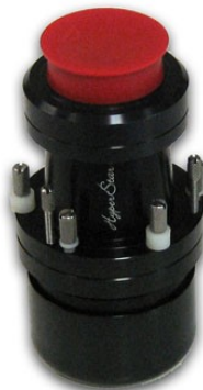
Holder capping the HyperStar