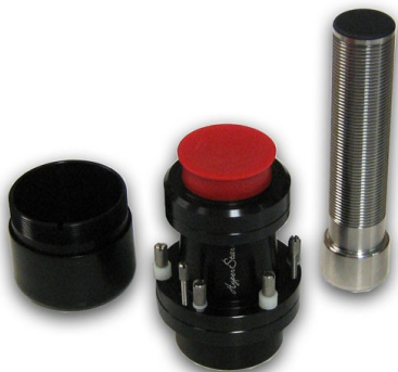
Secondary holder (ships attached to lens), HyperStar lens, and counterweight