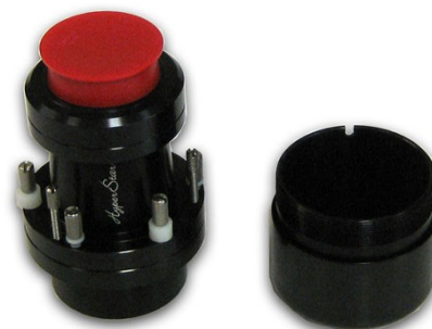
Holder removed to accept secondary mirror