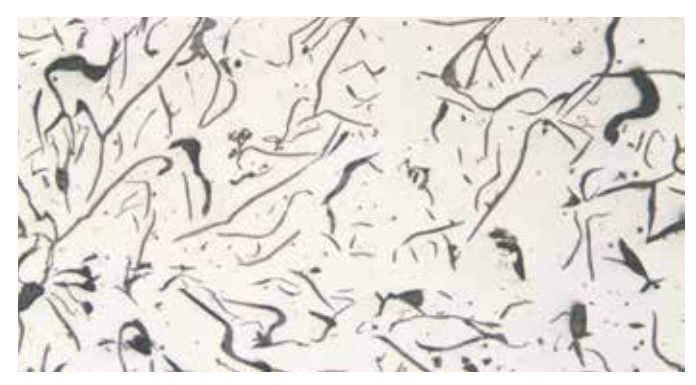
Materials Science example image: cast iron

The Olympus LC30 color camera for microscopy combines versatility with performance. With up to 37 frames per second (fps), faithful color reproduction, full integration into Olympus imaging platforms, and an excellent cost-performance ratio, the LC30 is the ideal entry-level microscope camera for quality bright-field imaging — suitable for applications in life and material sciences. The sensitivity and frame rate of the 3.1-megapixel CMOS chip can be increased using various binning modes, resulting in easy observation and focusing. The LC30 camera can be quickly and easily mounted on all microscopes equipped with a standard C-mount adaptor, and requires only a single USB 2.0 cable for high-speed data transfer and power supply. Its complete integration into the cellSens and OLYMPUS Stream imaging platforms helps ensure the seamless interaction of microscope, camera, and additional devices, delivering intuitive and efficient operation.