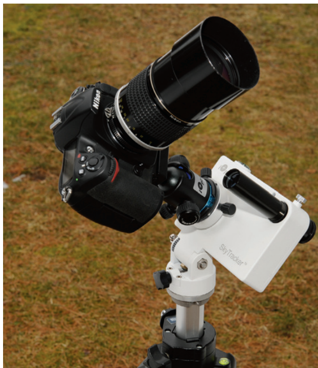
The author tested the SkyTracker with it attached directly to the center column of a heavy-duty Manfrotto tripod. If the polar-alignment scope interferes with equipment mounted on the tracker, it can be removed after the tracker is aligned.

And here's a word of caution: don't assume other polar-align apps will work. Astro-Physics has developed a similar app for its polar-alignment scope (January 2013 issue, page 37). But its app is incompatible with the SkyTracker because the Astro-Physics polar scope has a right-angle viewer that produces a different field orientation.