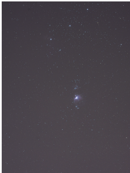
Left: Described in the accompanying text, this view shows how well SkyTracker kept a camera fixed on a star field during a nearly 5-hour span. The cropped image is from a stacked pair of 3-minute exposures made at the beginning and end of the interval and aligned to the frame edges, not the stars. Right: Because of its precise polar-alignment system, accurate drive rate, and solid construction, the SkyTracker is suitable for use with modest telephoto lenses. This 3-minute exposure of the region around the Orion Nebula was made with a 180-mm lens and full-frame DSLR camera.