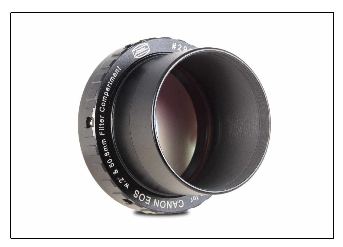
Fig. 3: Illustration: Protective T-Ring for Canon EOS with 2" socket (S52/2")