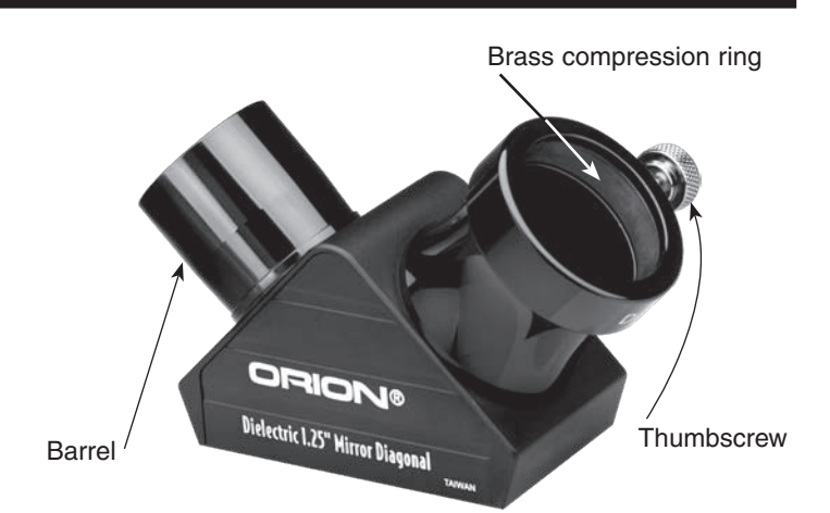
The Orion 1.25" High Reflectivity Mirror Star Diagonal

The 2" star diagonal will accept either 2" or 1.25" eyepieces using the supplied 1.25" eyepiece adapter. If using 2" eyepieces, remove the 1.25" adapter from the diagonal.