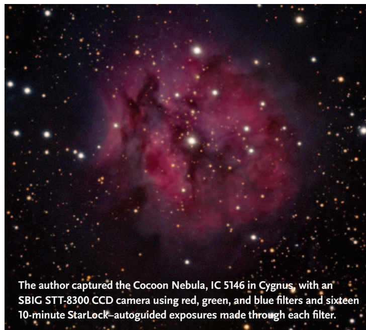
The author captured the Cocoon Nebula, IC 5146 in Cygnus, with an SBIG STT-8300 CCD camera using red, green, and blue filters and sixteen 10-minute StarLock-autoguided exposures made through each filter.

I was as amused as my colleagues when a freight truck arrived at our offices to unload the LX850; the shipment included nine boxes (one of them huge) totaling 379