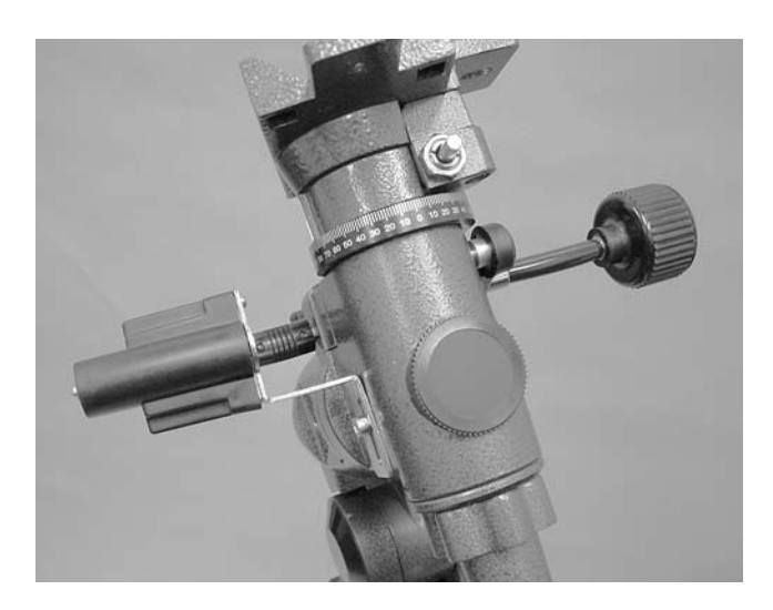
Figure 4: The R.A. motor drive assembly properly connected to the mount.