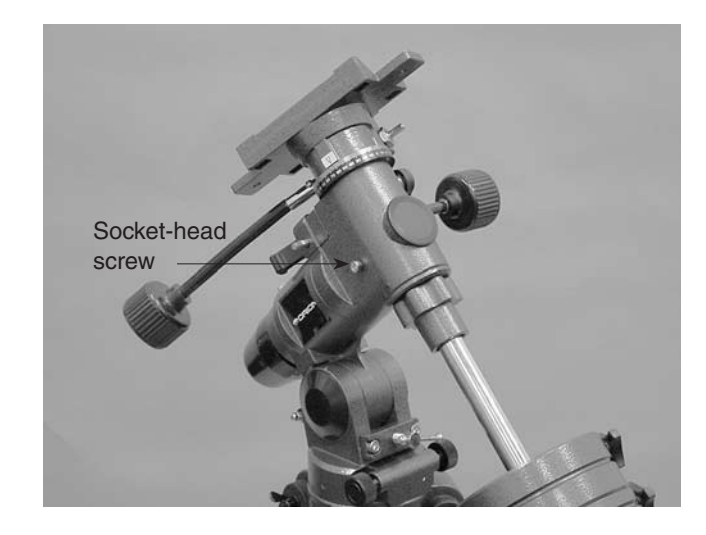
Figure 3: Remove the socket-head screw indicated on the mount.